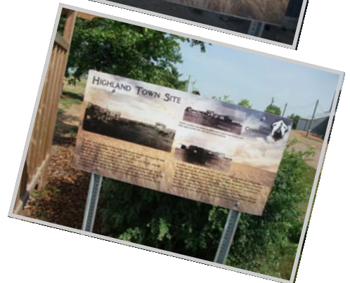
photos of historical markers placed at historical sites